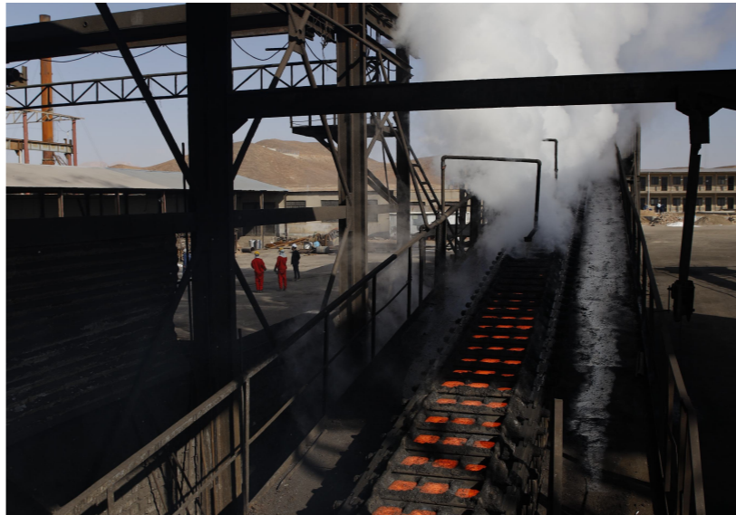
PIG IRON AND STEEL BILLETS

Staff: 522 Annual production: 30,000 tons HC & 16,000 tons LC Annual domestic demand: 10,000 tons HC & 4,000 tons LC Export volume: 20,000 tons HC & 12,000 tons LC Annual chromite demand (raw material): 120,000 tons