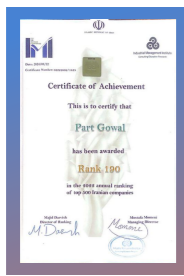
IMI Rank 190