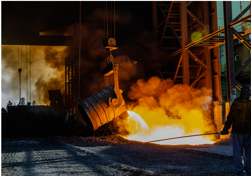
HIGH-CARBON AND LOW CARBON FERROCHROME